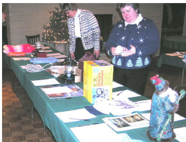
Members generously donated items for the silent auction. The chapter made over $400 from the auction.