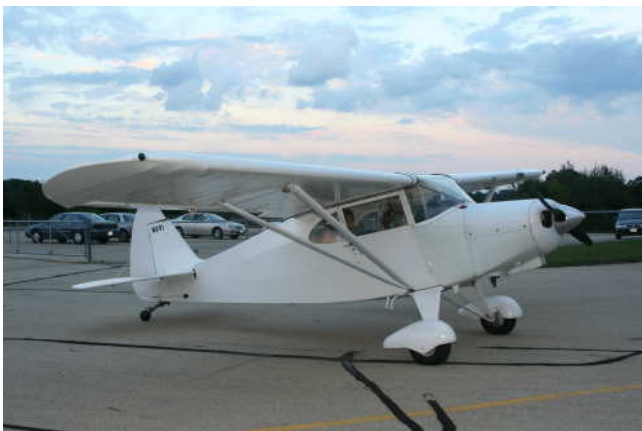
Ed Lachendro's new 1949 Piper PA 16 Clipper powered by a Lycoming 0-235.