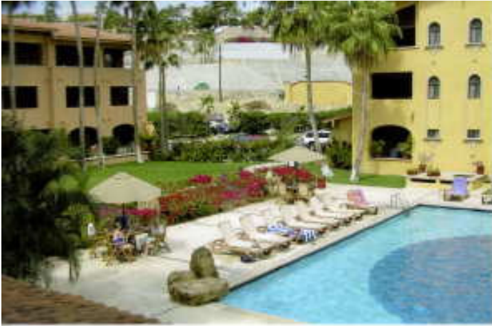
Picture of the pool from the condo deck where Dale, Bob, and Dick were girl watching.