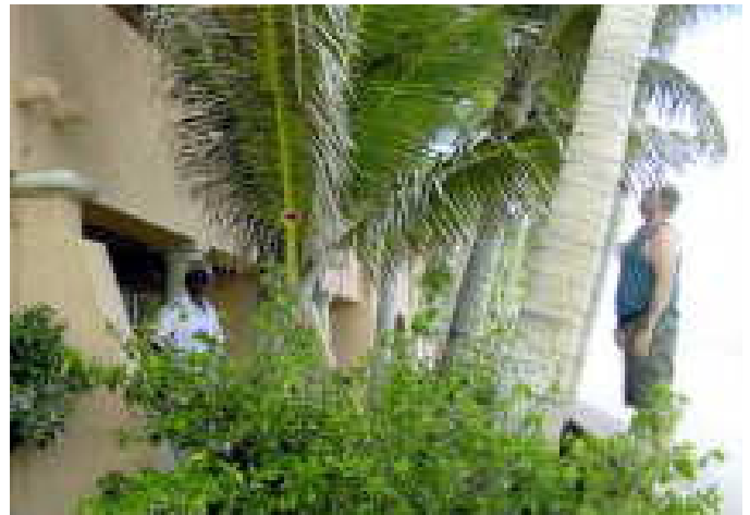
Dale Wahl gets a security agent to pick a coconut.