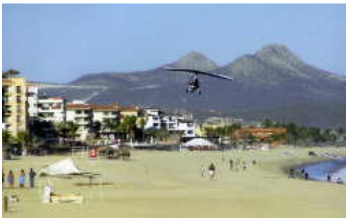
Dick Siedschlag flying in a Trike.