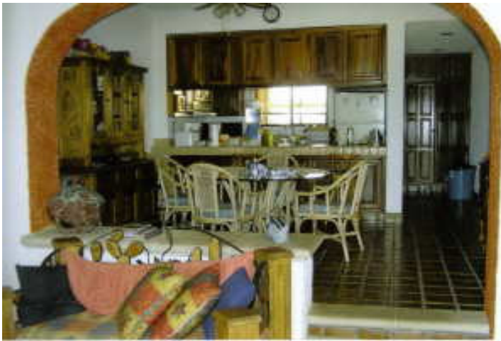
Eating area in the condo they rented.