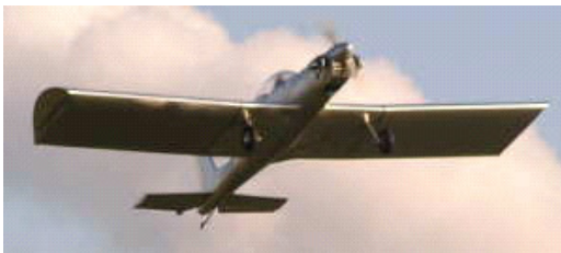
Ultra Cruiser, like Cleo Kahlhamer is building,