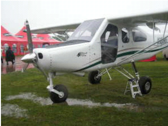
NEW! E-7 Bushplane EOL. 7 seats, 400 HP, max weight 5070 lbs.

Pictures don't have to be of AirVenture. They can be of anything that flies. Your first airplane, your best airplane, interesting fly-in's. Don't keep them to yourself! If you have hard copies, I can scan them in and return them unharmed.