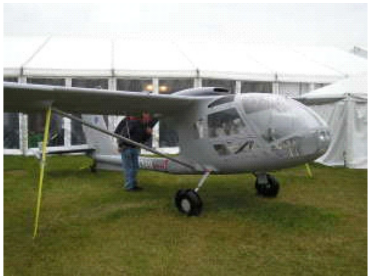
Seabird SB7L Powered by a Lycoming O-360A. They should have called it "Strange Bird"