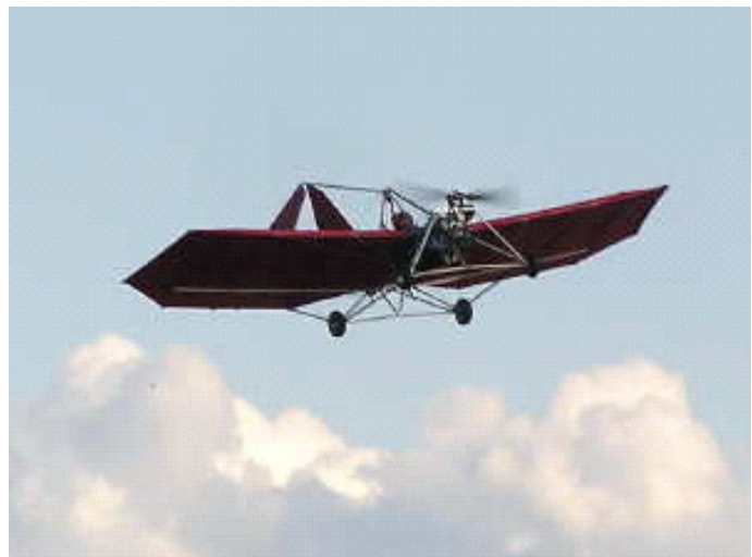
Snedden M7 Wierdest plane at AirVenture. Hey Batman, someone stole the Bat Plane!!